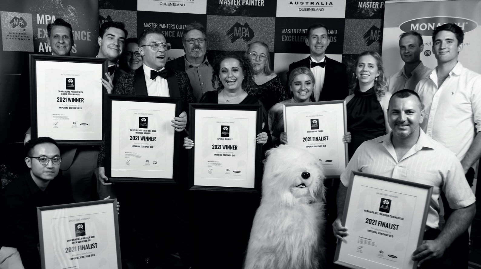
PICTURED: OVERALL WINNER, IMPERIAL COATINGS QLD