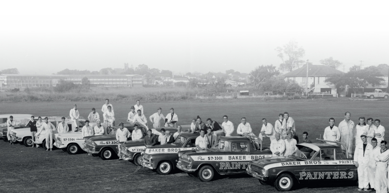
MASTER PAINTERS ASSOCIATION OF QUEENSLAND